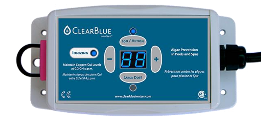
The System Controller has two main functions: Ion/Action and Large Dose